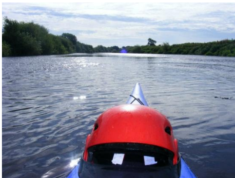
Long sunny stretch just after the A1237