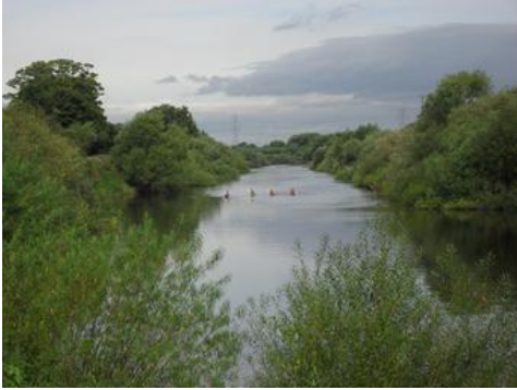
Section of the Ouse as seen from Nether Poppleton

river as well as a boat hiring service. When getting out at Marygate, you are able to get a car/minibus with trailer near to the river.