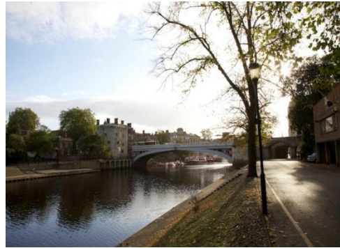
Railway bridge just before Marygate, York