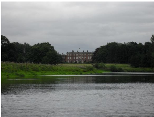
First view of Newby Hall

Shortly after you join the river, Newby Hall will come into view which was designed by Sir Christopher Wren in 1690 and worth a visit if time permits. Around 500 metres down river, you will need to take a right hand turn to the lock and avoid the weir. There are large signs to advise you of this however if you do miss them, there are also large buoys blocking the way. From this point, it is an hour's gentle paddle to Boroughbridge, where there are toilets in the river bank with easy access. There is another weir here that is blocked off by buoys and therefore another lock to portage, this is the last one until you get to Linton Lock. From here on in, you will be paddling through farm land for approx. 2 hours before you get to Aldwark Bridge (Toll). You will know this as it sounds like it is about to fall down when cars cross it! Then another hour to Linton Lock where there will be a pint waiting for you!